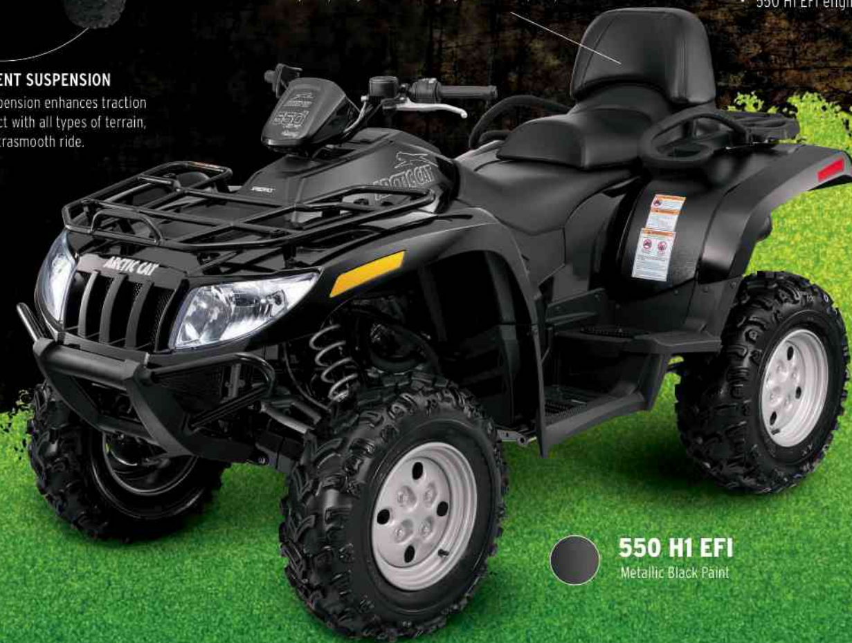
550 HI EFI Metallic Black Paint

If you want to remove the passenger seat, just pull two pins and replace it with a 200-lb.-capacity SpeedRack or heavy-duty cargo box with a tailgate. It's all up to you.