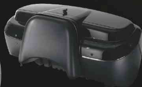
TRV CRUISER REAR CARGO BOX 1436-211