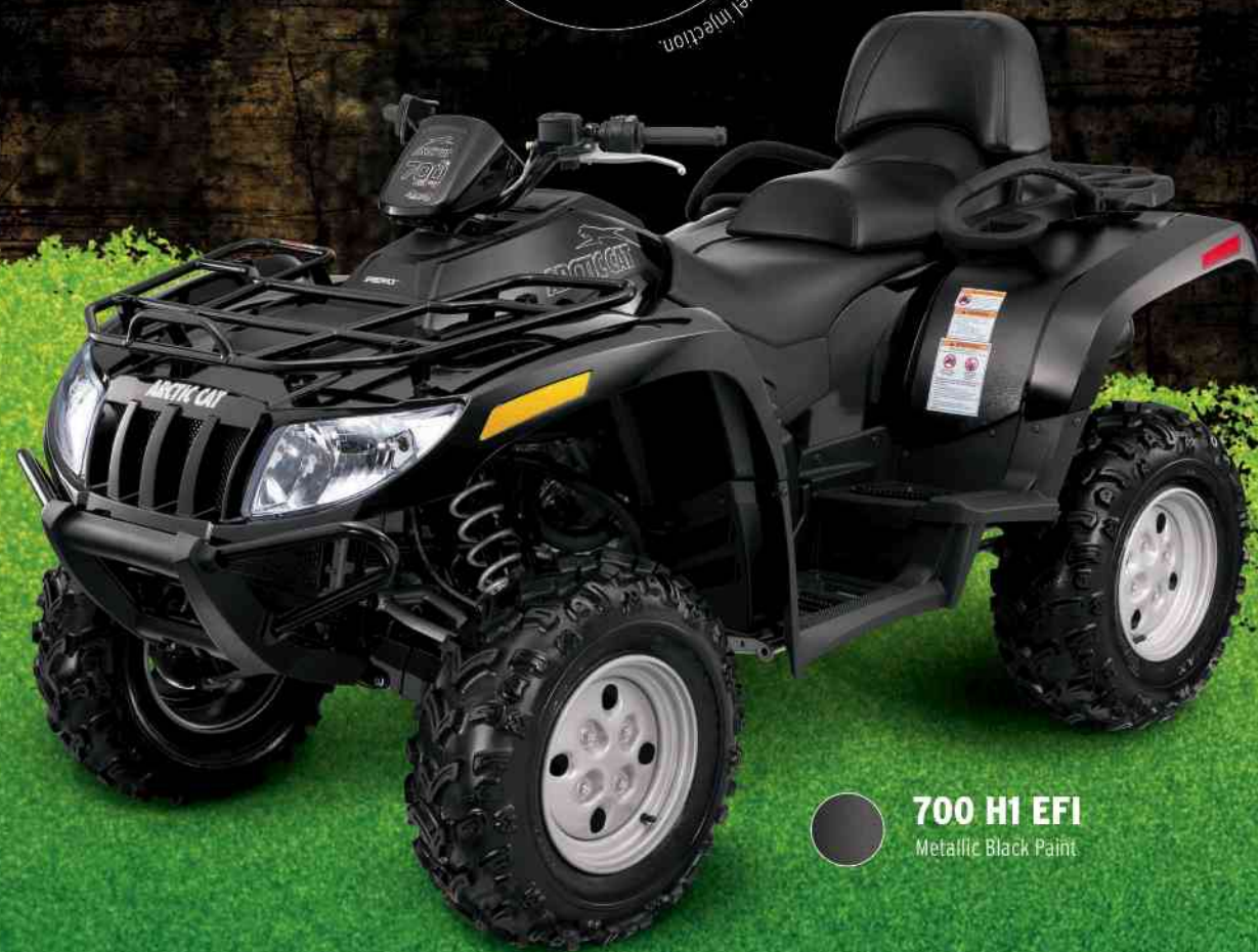
700 HI EFI Metallic Black Paint

The TRV 550 is a true statement of value and comfort. This machine is as affordable as it is ravenous for adventure. And once you hit the trail to witness all the things you've been missing, your machine instantly paid for itself.