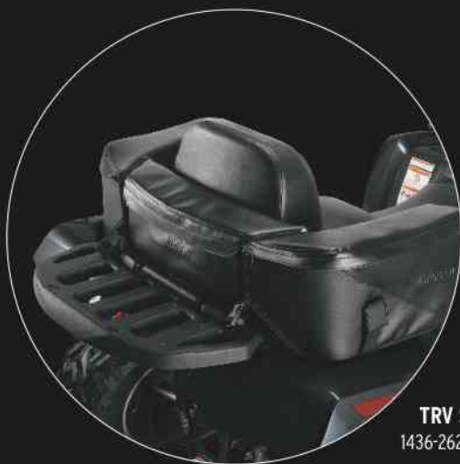
TRV SADDLEBAGS 1436-262