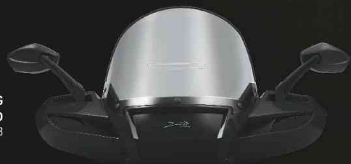
TOURING WINDSHIELD 1436-233

When you're heading out for that long weekend excursion, you'll need all the right accessories. Like a touring windshield with built-in beverage holder and dual mirrors, durable saddlebags and a lockable rear cargo box for plenty of secure storage. Let the adventure begin. Stop by your local Arctic Cat® dealer for more information.