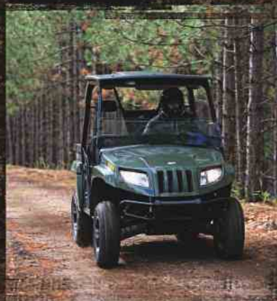
ROOF KIT 1436-330