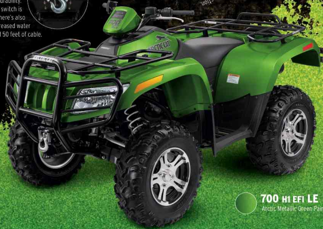
700 H1 EFI LE Arctic Metallic Green Paint