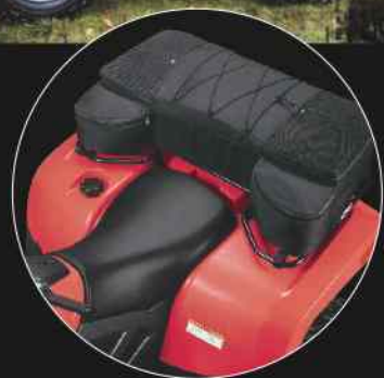
DELUXE BLACK RACK BAG - REAR 1436-084