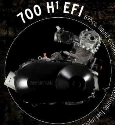
700 H1 EFI 695cc, liquid-cooled engine with electronic fuel injection