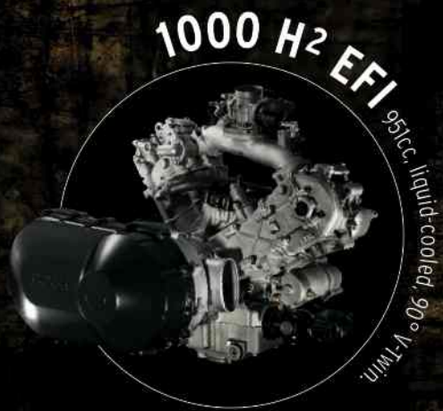
1000 H2 EFI 951cc, liquid-cooled, 90° V-TWIN