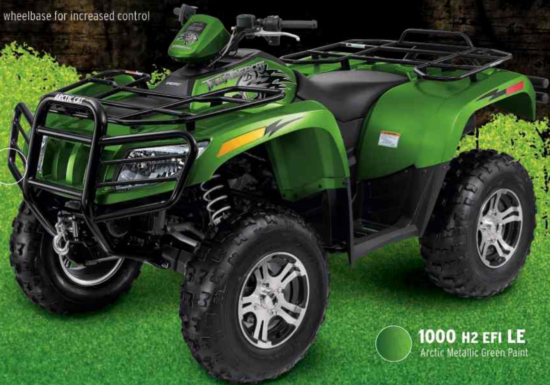
1000 H2 EFI LE Arctic Metallic Green Paint