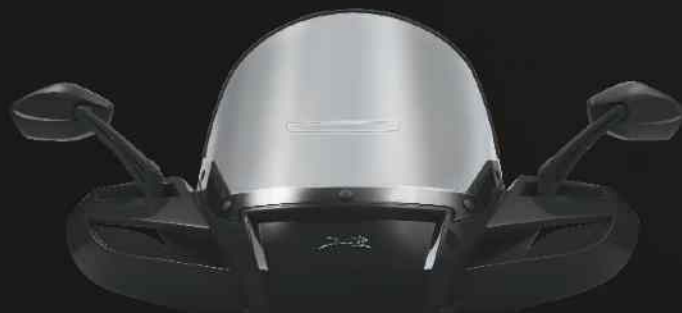
TOURING WINDSHIELD 1436-233

This machine certainly doesn't come limited in the accessory department, that's for sure. Accessories like a protective touring windshield, front and rear deluxe black rack bags and a SpeedRack® propel this LE to the top of the line.