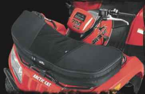
DELUXE BLACK RACK BAG - FRONT 1436-083